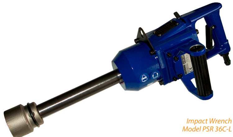
Impact Wrench Model PSR 36C-L