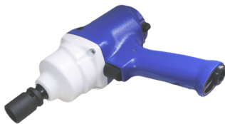
Impact Wrench Model SMP 085-1/2\"/>

most suitable belt sander; please speak with our product specialists and refer to the technical data located in our catalogs.